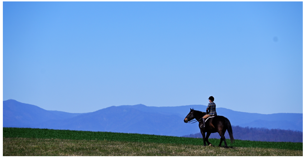
Above: Views of the Blue Ridge Mountains during March Madness

Another March Madness has come and gone, which also means our 22/23 season has sadly come to a close. Everyone had a great time, with five fantastic days of hunting and relatively good weather, only cancelling on the final day due to soaking rains. Riders from around the country, including new friends from Belle Meade (GA) and our faithful Battle Creek Hunt (MI) friends that have made this event a yearly pilgrimage, joined us for the week. There was even one international guest partaking this year. "A picture is worth a thousand words", so please enjoy a visual representation of the week rather than the usual newsletter babblings!