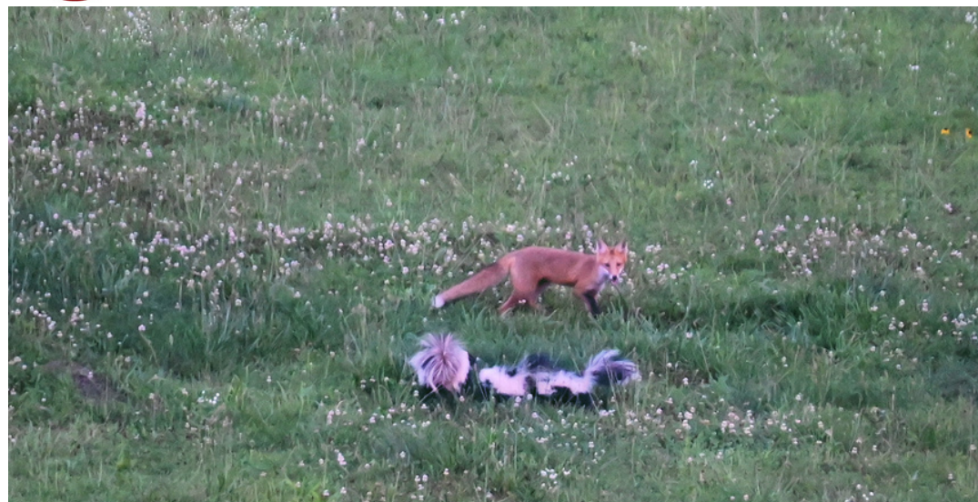
Above: Fox attending the Skunk Parade.