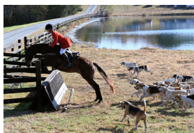
Photos from Opening Meet - View more on our Facebook Page