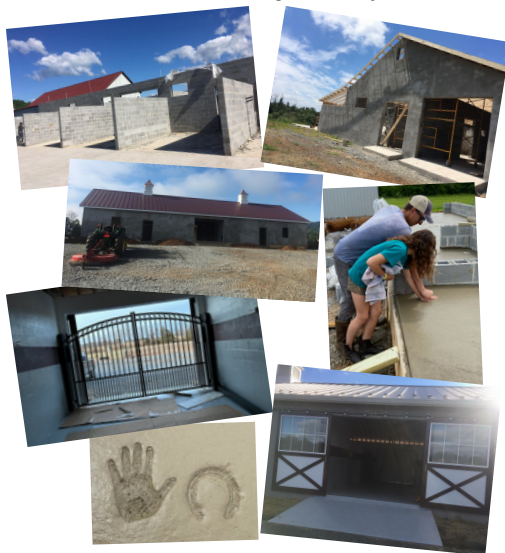
Photos of Kennel Progress - View more on our Facebook Page For more updates on the project, visit our website and click "Kennel Construction Updates" at the top.

There has been some amazing progress at the kennels over the last few months. Floors, roofing, and painting were completed in early Autumn. In November, the electrical rough in was finished with almost one mile of wiring! The doors and gates have all been delivered and are starting to be hung, along with starting installation of plumbing and HVAC. The last step will be the fencing for the runs. We are hoping to move the hounds in during February. Woohoo!