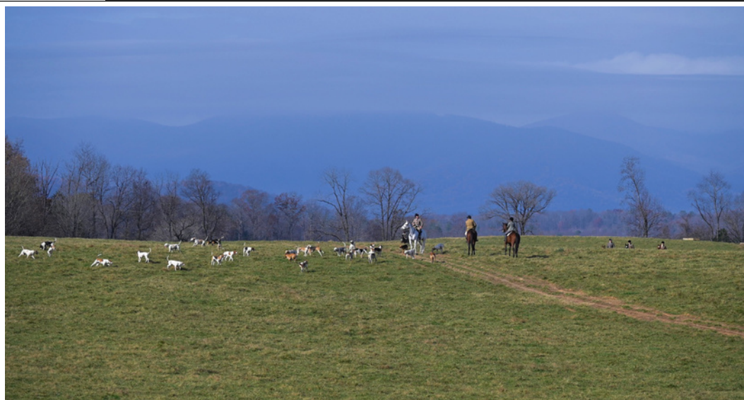
Above: Hunting from The Hill on November 10th, 2022