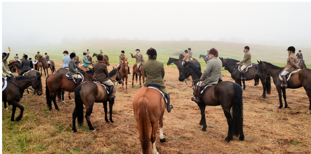
A foggy morning at March Madness in 2021