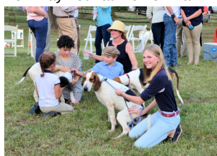
Left: 2019 Puppy Party at Meander Inn