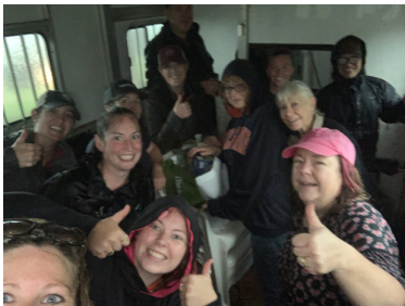
Left: Show staff & volunteers piled in a horse trailer, waiting for the storm to pass.