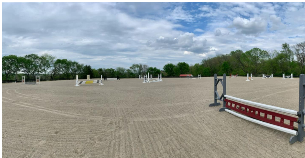
Above: View of the Jumper Ring.